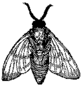
Figure 3. A sample black and white graphic that has been resized with the includegraphics command.

As was the case with tables, you may want a figure that spans two columns. To do this, and still to ensure proper “floating” placement of tables, use the environment figure* to enclose the figure and its caption. And don’t forget to end the environment with figure* , not figure !