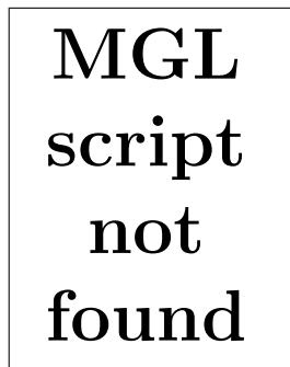
Figure 2: This box is shown by mgltex instead of a script that should be included, but can't be found.