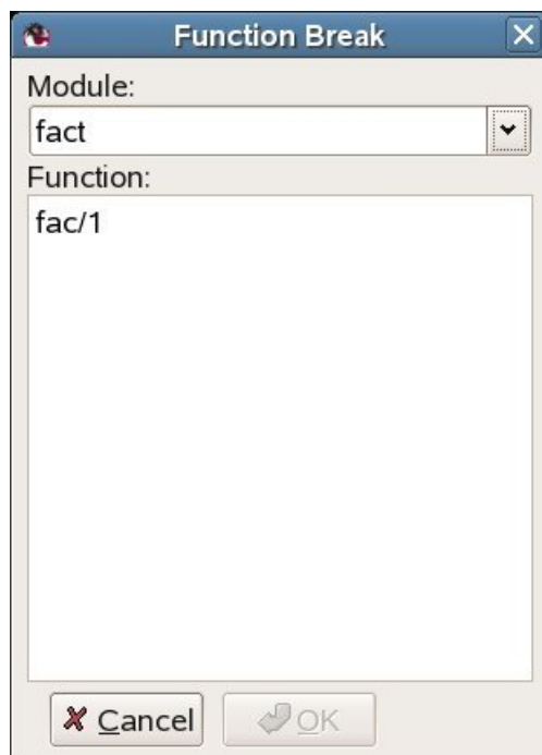
Figure 2.3: Function Break Dialog Window

A function breakpoint is a set of line breakpoints, one at the first line of each clause in the specified function.