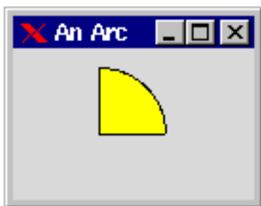
Figure 8.6: Canvas Arc Object

The canvas arc object is defined within a rectangle and is drawn from a start angle to the extent angle. Origo is in the center of the rectangle.