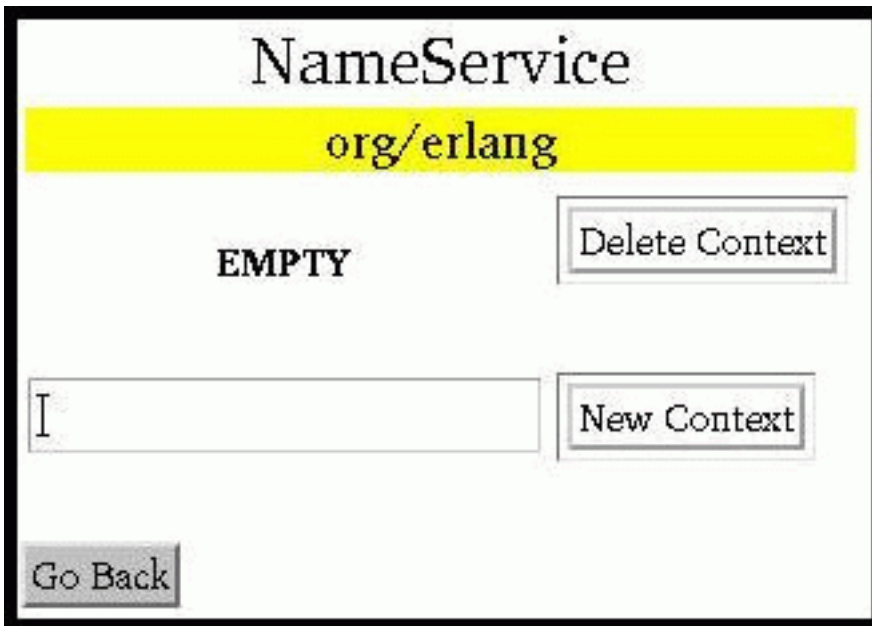
Figure 12.6: Delete Context.

If a context does not contain any sub-contexts or object bindings, it is possible to delete the context. If these requirements are met, a Delete Context button will appear. A completion status message will be displayed after deleting the context.